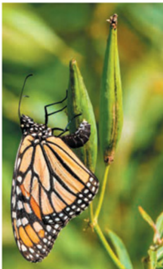
A monarch butterfly lays a white egg from the end of her body.

Could you eat the same food for every meal? Human babies do. Babies drink their