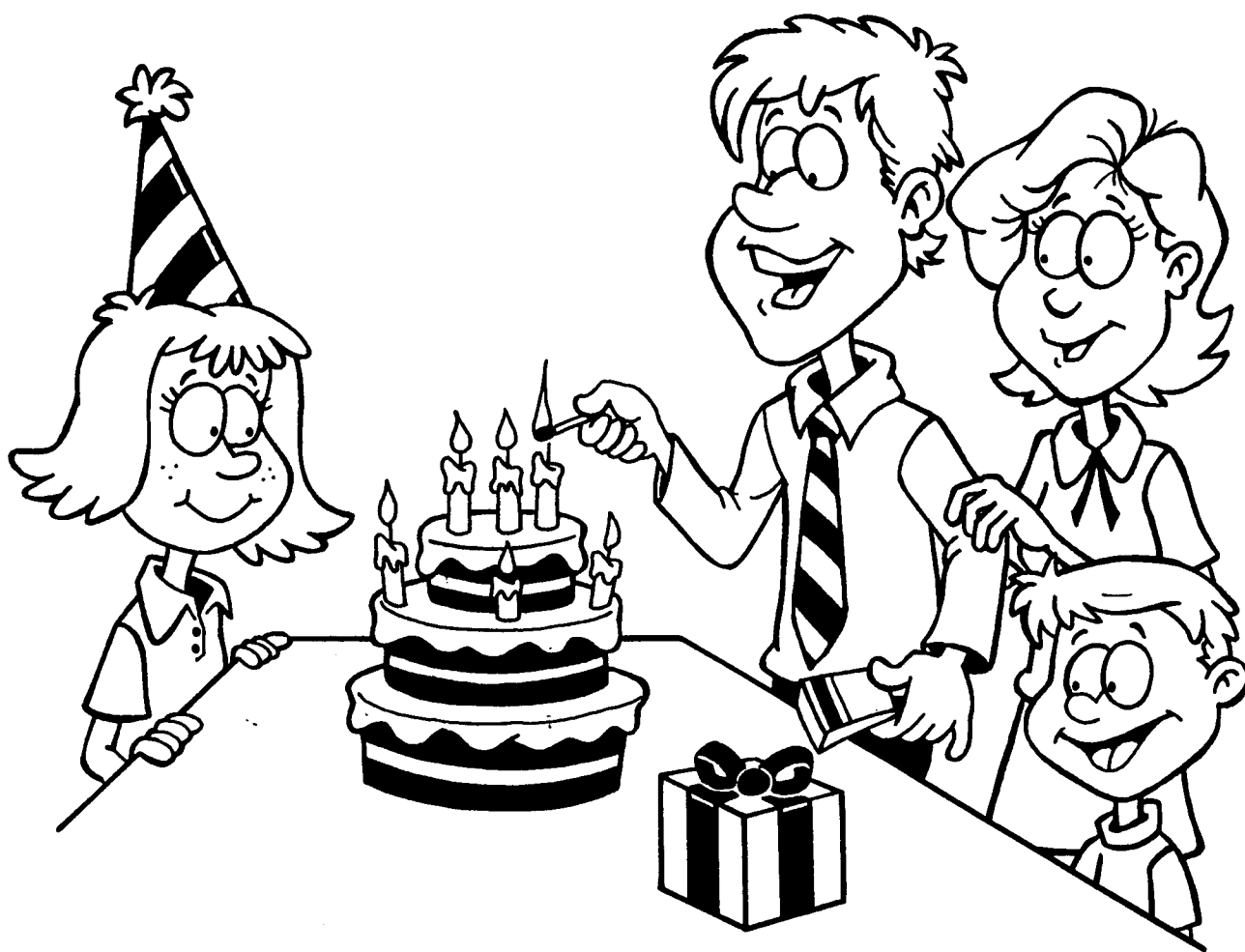
ANN'S BIRTHDAY PARTY