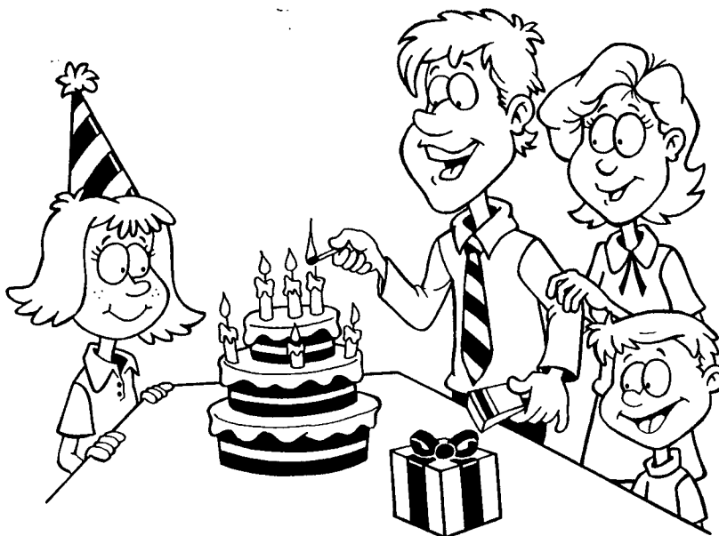
ANN'S BIRTHDAY PARTY

Before beginning, the instructor should give each student the worksheet that corresponds to the instructor's worksheet. Before reading Story #1, the instructor should ask the students to listen carefully to three questions and remember the information as the story is read. The instructor then reads the story aloud. After the story is read, the instructor asks the same three questions along with two additional questions for the students to answer aloud. Their large picture should provide visual clues. In Story #2, the same process is repeated, keeping in mind that the questions and story do not refer directly to the picture.