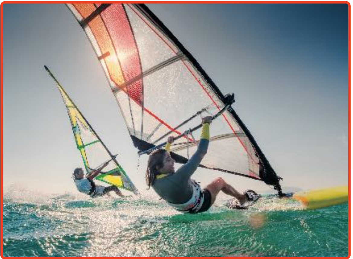
To “carve” a jibe, you lean into the turn.

A “jibe” is a smooth half turn away from the wind. To “carve” a jibe, you lean into the turn. You move the boom from one side to the other. The sail sweeps you through the curve.