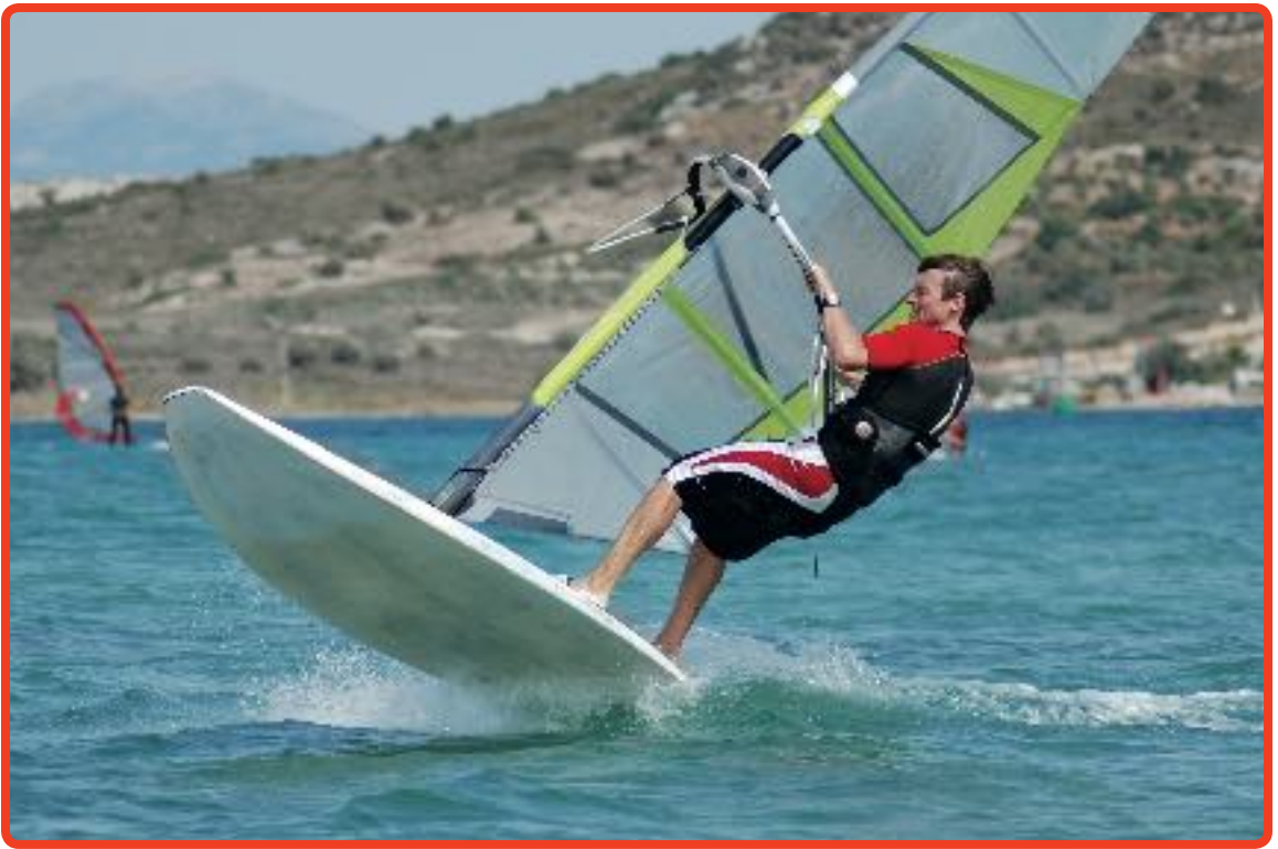
Lean back a bit to lift the mast up.

Lean back a bit to lift the mast up. Then bend down and pull the rig up toward you. Put both hands on the mast just below the boom. Let the sail flap. This will show you which way the wind is blowing.