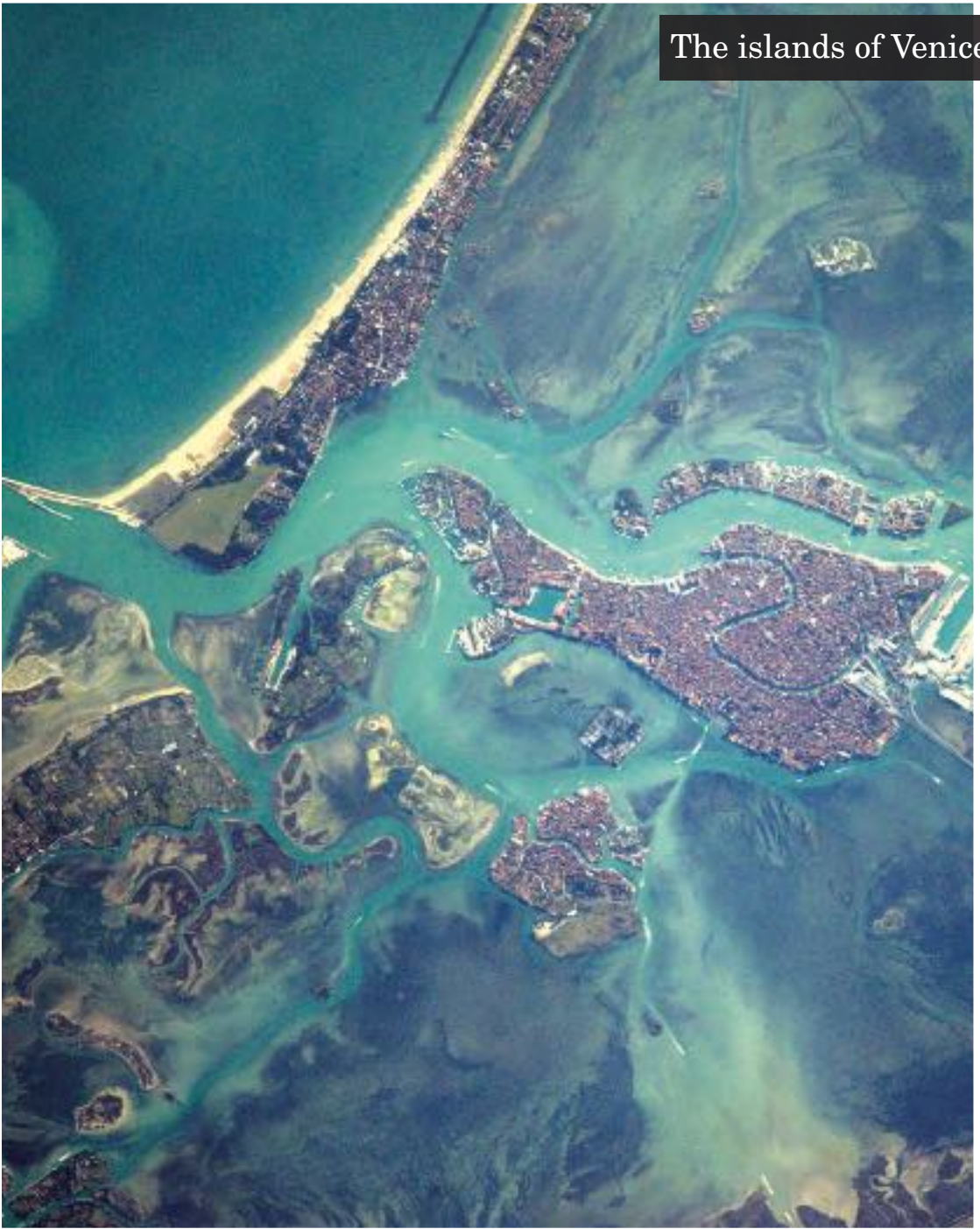
The islands of Venice