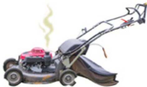
a lousy lawn mower