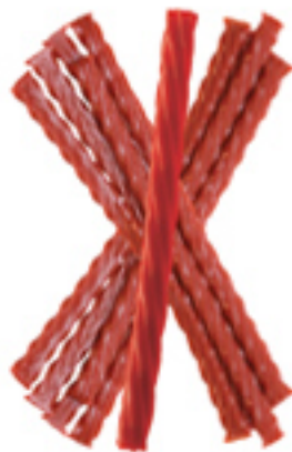
lots of licorice