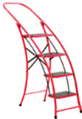
a lopsided ladder