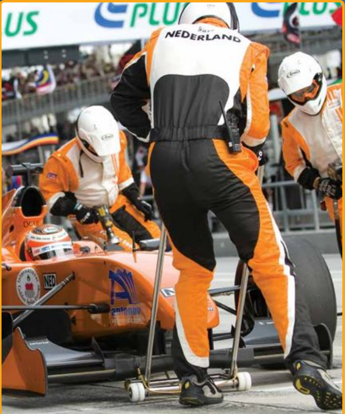
People at both ends of the car work the jacks.