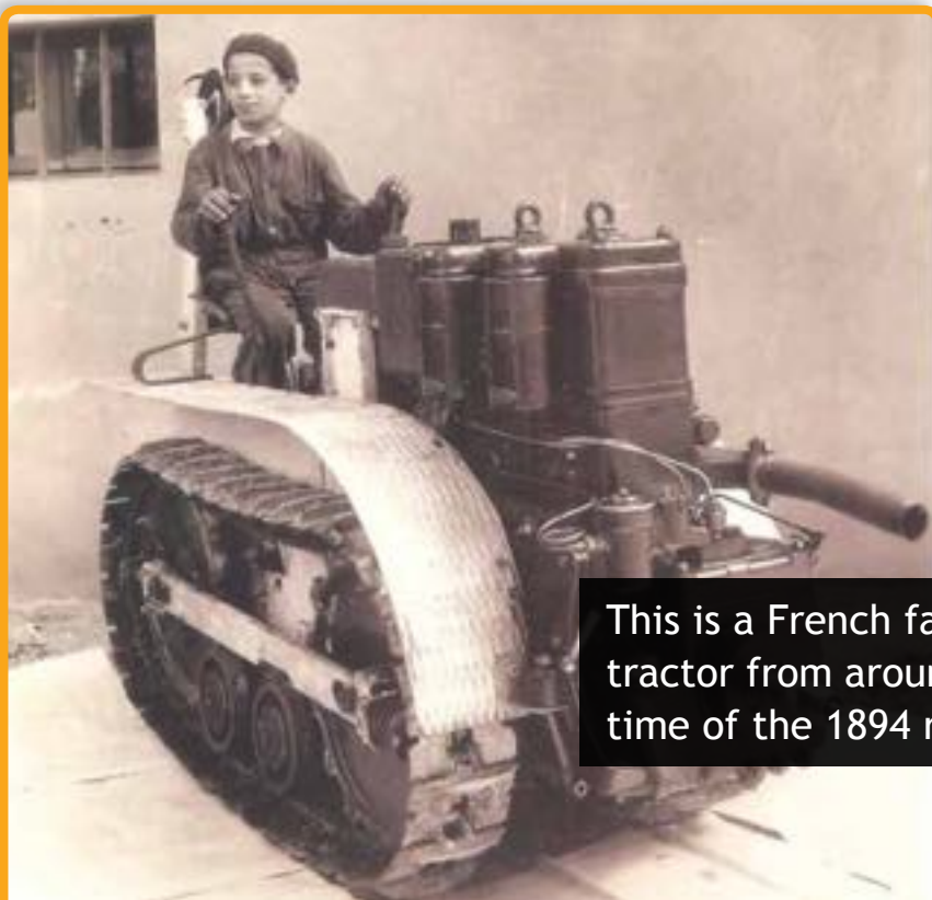
This is a French farm tractor from around the time of the 1894 race.

The top speed was 10½ miles an hour. A farm tractor came in first. Even so, the tractor didn't win the grand prize. It wasn't a car!