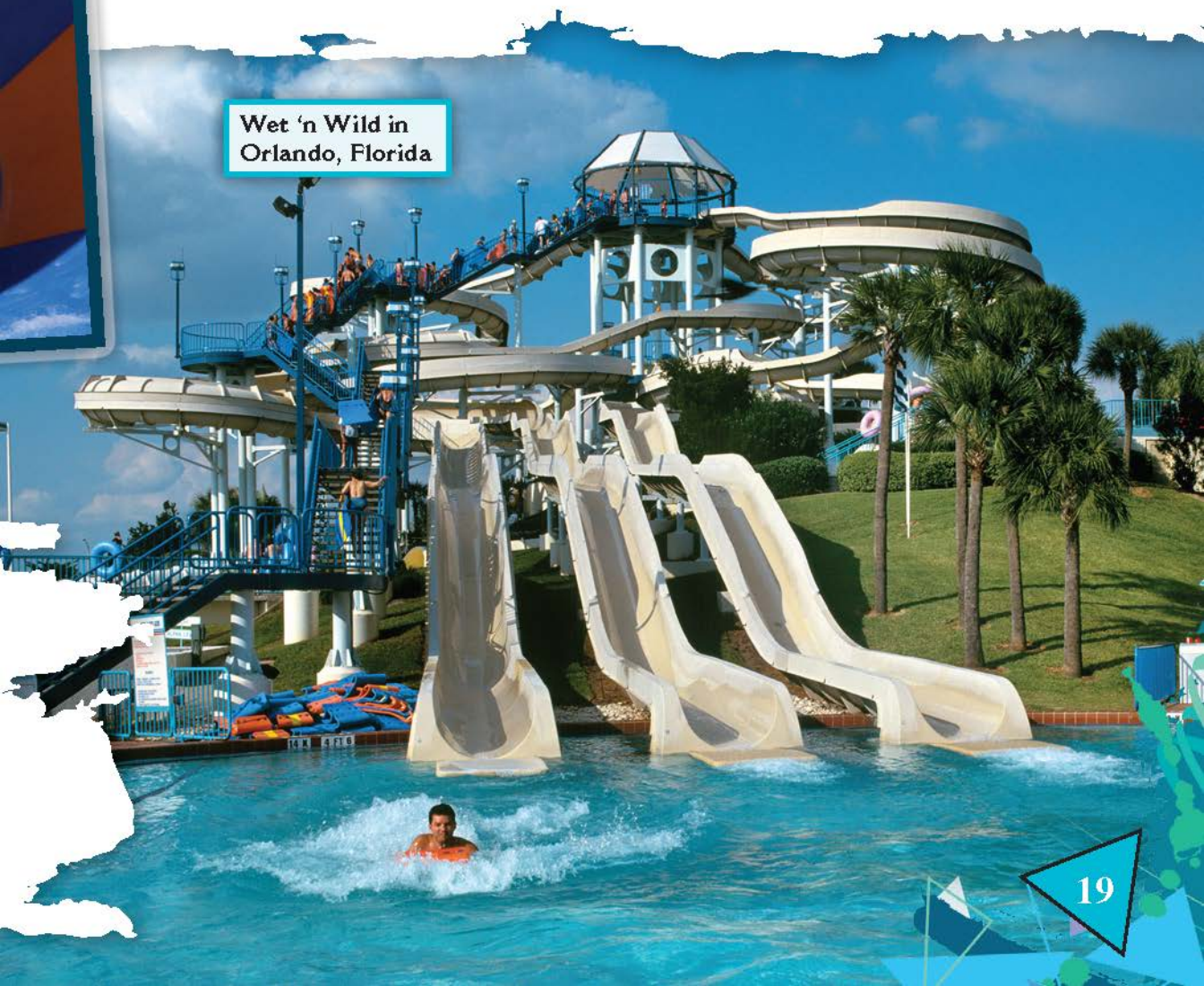
Wet 'n Wild in Orlando, Florida