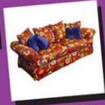
Around the Home