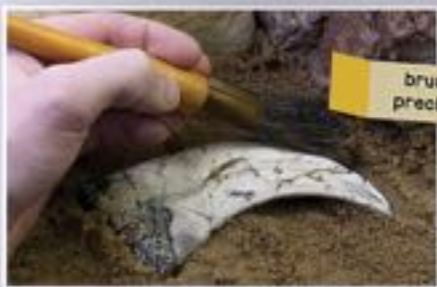
brushing sand off a precious dinosaur claw

"He's a paleontologist. That means he's an expert on ancient life. He goes on fossil digs to find out what life was like millions of years ago."